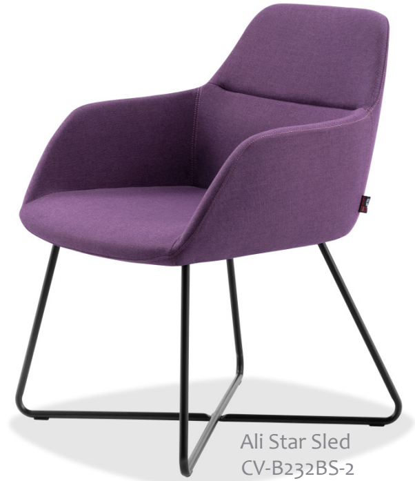
Ali Star Sled CV-B232BS-2

Perfectly suited across a diverse range of interior workspaces, breakout and seating areas in the public, aged care, health care, hospital and education sectors.