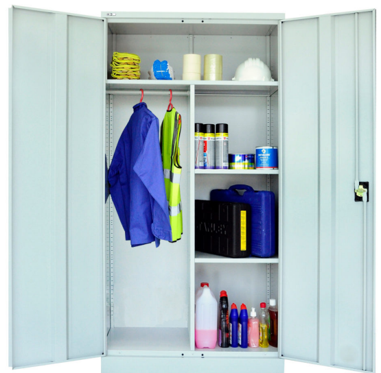
Steel Wardrobe (GWA18)