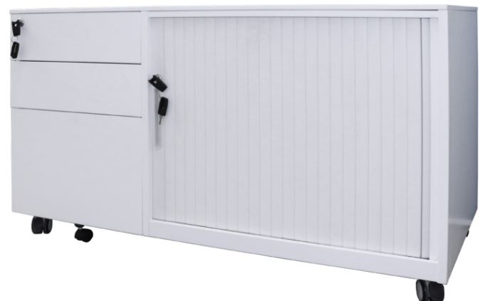
Steel Mobile Caddy & Pedestal (GCADN-L/R)