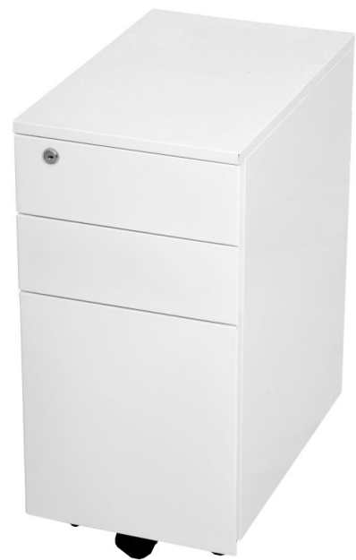
Steel Slimline Mobile Pedestal (GSP3)