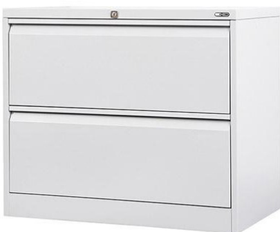
Steel Lateral Filing Cabinet 2 Drawer (GLF2)