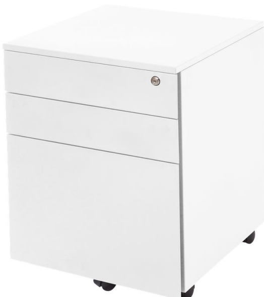
Steel Mobile Pedestal (GMP3)