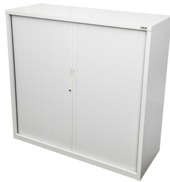
Steel Tambour Unit Medium (GTD129)