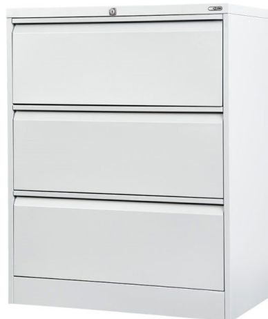
Steel Lateral Filing Cabinet 3 Drawer (GLF3)