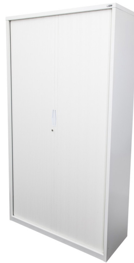
Steel Tambour Unit Large (GTD199)