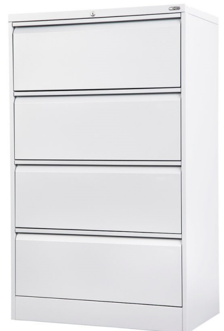
Steel Lateral Filing Cabinet 4 Drawer (GLF4)