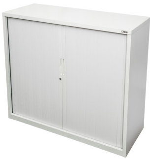
Steel Tambour Unit Small (GTD109)

Perfectly suited across a diverse range of interior workspaces within the commercial, aged care, health care, hospital and education sectors.