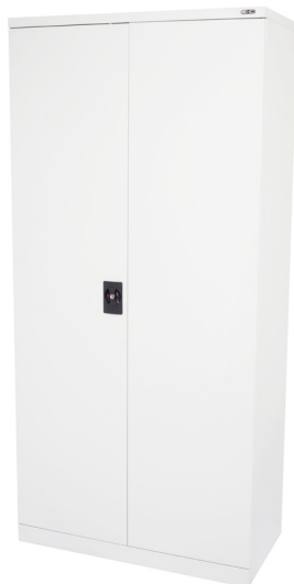
Steel Cabinet Medium (GCA18)