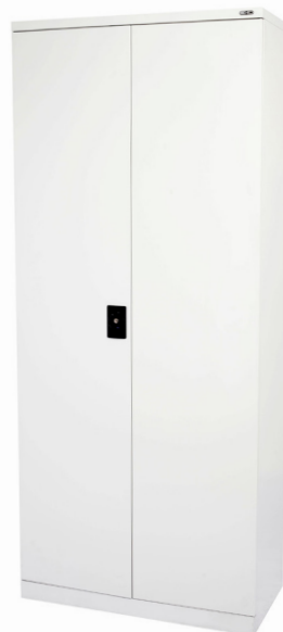
Steel Cabinet Large (GCA20)