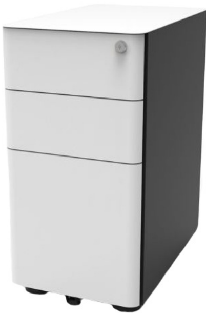
Steel Slimline Mobile Pedestal Two - Tone (EMP WB)

Perfectly suited across a diverse range of interior workspaces within the commercial, aged care, health care, hospital and education sectors.