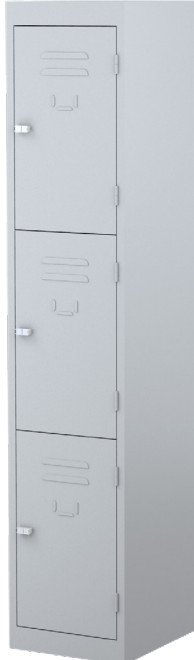
THREE DOOR LK3T380