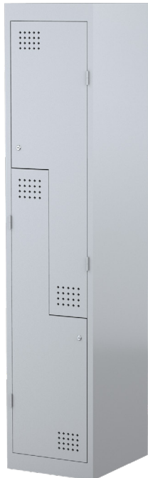
TWO DOOR COMBO LK2COMBO