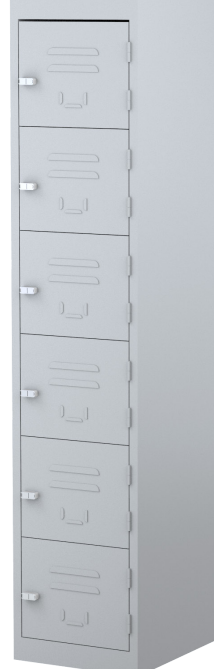
SIX DOOR LK6T380