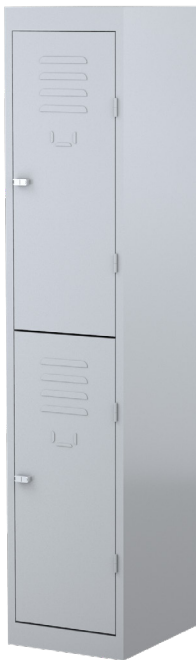
TWO DOOR LK2T380