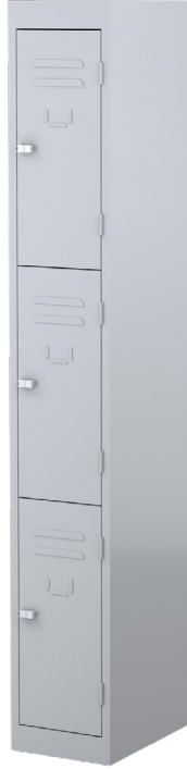
THREE DOOR LK3T305