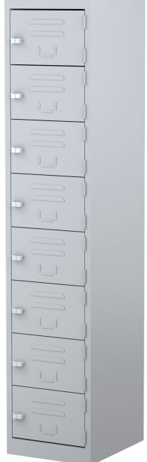
EIGHT DOOR LK8T380