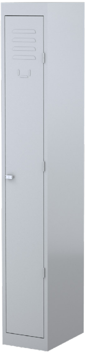
ONE DOOR LK1T305

Perfectly suited across a diverse range of interior workspaces in the commercial, aged care, health care, hospital and education sectors.