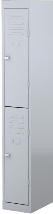
TWO DOOR LK2T305