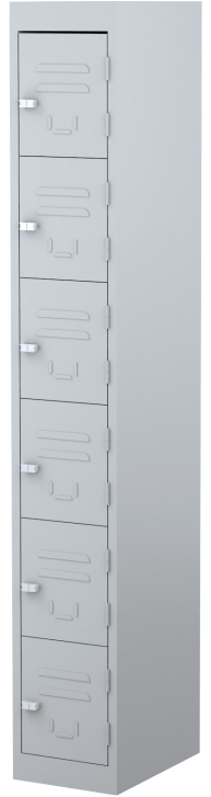
SIX DOOR LK6T305