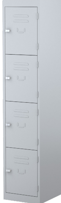
FOUR DOOR LK4T380