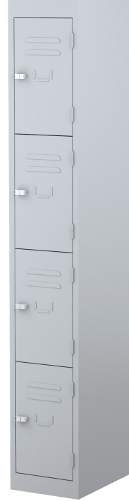
FOUR DOOR LK4T305