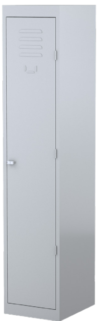
ONE DOOR LK1T380