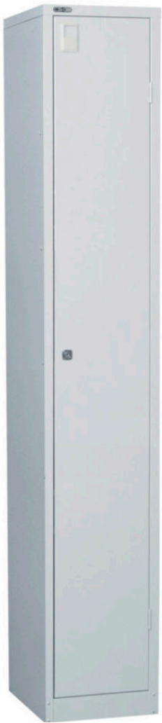
ONE DOOR GL305/1 and GL380/1

Perfectly suited across a diverse range of interior workspaces in the commercial, aged care, health care, hospital and education sectors.