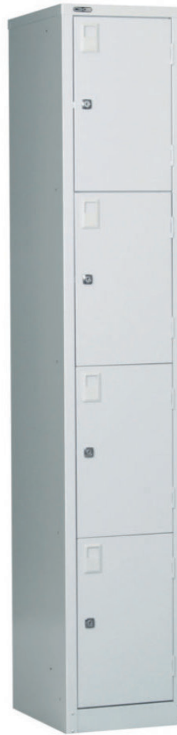
FOUR DOOR GL305/4 and GL380/4