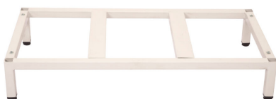
Locker Stand SB2305 and SB3305