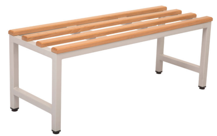
Bench Seat BS1000