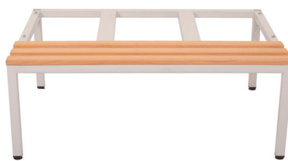
Locker Seat and Stand S+S2305 and S+S3305