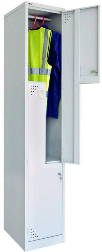
STEP LOCKER Allows Hanging Space Per Locker