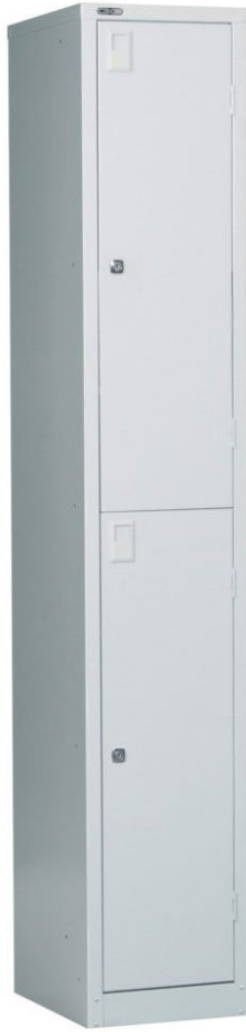
TWO DOOR GL305/2 and GL380/2