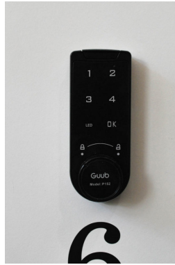
Optional Digital Lock

(Please note - 380 mm only available with Bench Seat.)