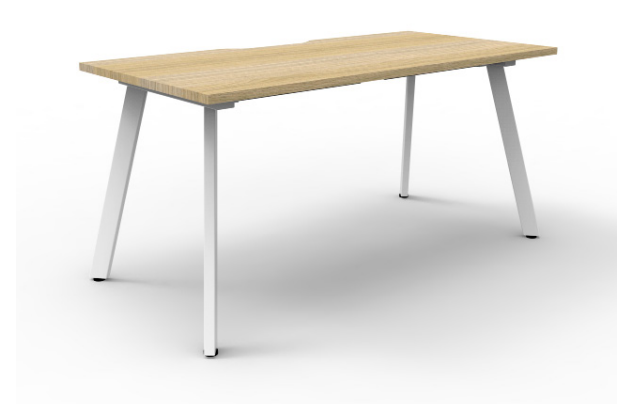
Single Sided Workstations Available with or without screens. Desk sizes to suit: Single User Two Users Three Users Four Users Five Users

Perfectly suited across a diverse range of workplace interiors where desking is required within the Aged Care, Health Care, Hospital, Commercial, Government and Educational sectors.