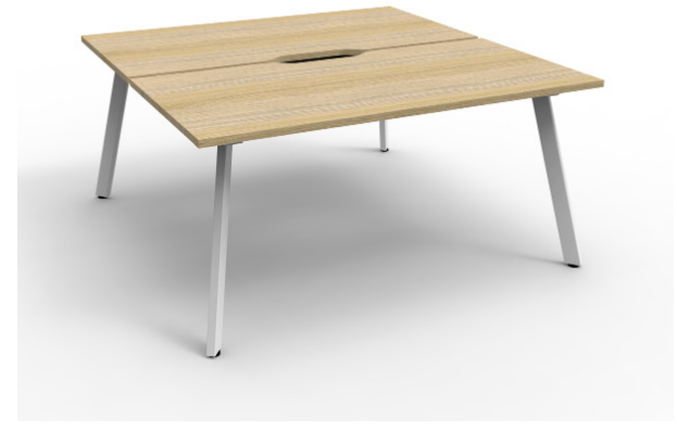
Double Sided Workstations Available with or without screens. Desk sizes to suit: Two Users Four Users Six Users Eight Users Ten Users