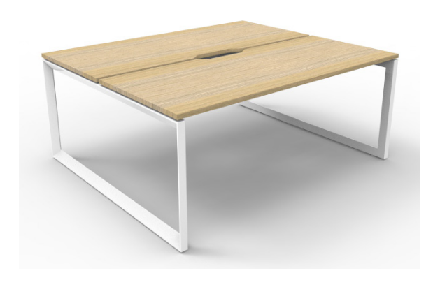
Double Sided Workstations