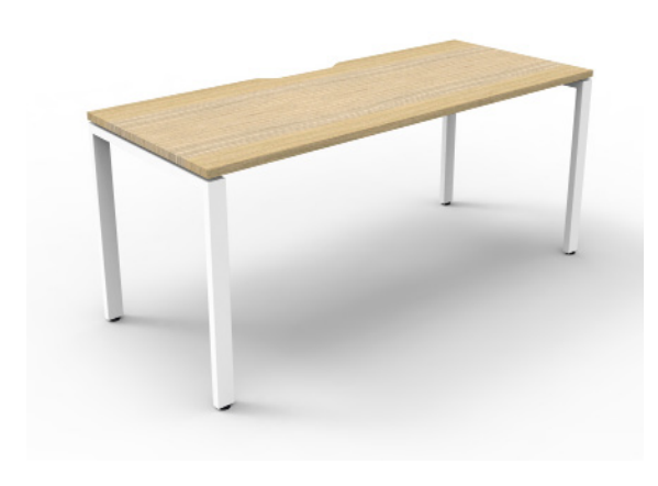
Single Sided Workstations Available with or without screens. Desk sizes to suit: Single User Two Users Three Users Four Users

Perfectly suited across a diverse range of workplace interiors where desking is required within the Aged Care, Health Care, Hospital, Commercial, Government and Educational sectors.