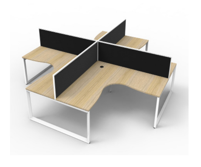
Group Workstations with Screens Desk size to suit 4 persons. Available in two sizes: 1500 or 1800 mm.