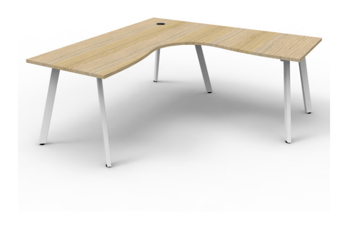
Corner Workstations Available with Screen attachment. Available in two sizes: 1500 or 1800 mm.