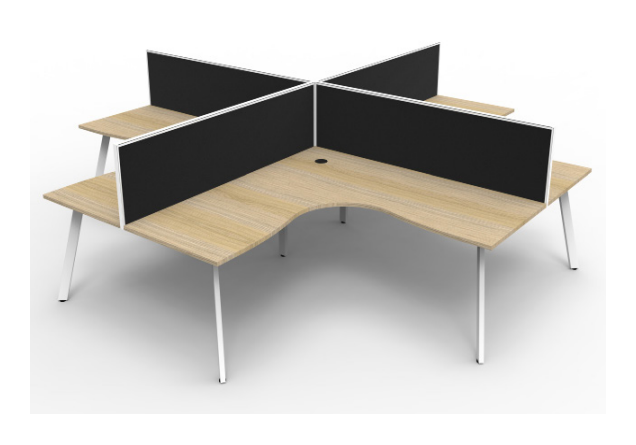
Group Workstations with Screens Desk size to suit 4 persons. Available in two sizes: 1500 or 1800 mm.