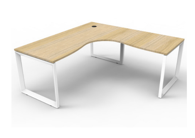
Corner Workstations Available with Screen attachment. Available in two sizes: 1500 or 1800 mm.