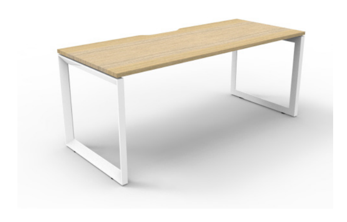
Single Sided Workstations Available with or without screens.

Perfectly suited across a diverse range of workplace interiors where desking is required within the Aged Care, Health Care, Hospital, Commercial, Government and Educational sectors.