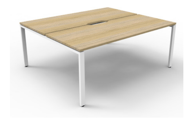
Double Sided Workstations Available with or without screens. Desk sizes to suit: Two Users Four Users Six Users Eight Users Ten Users