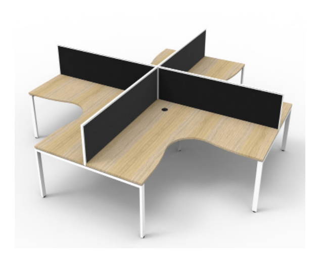
Group Workstations with Screens Desk size to suit 4 persons. Available in two sizes: 1500 or 1800 mm.