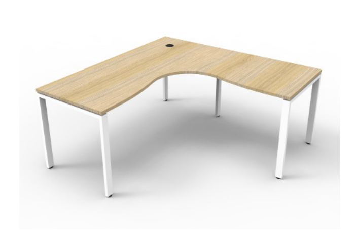
Corner Workstations Available with Screen attachment. Available in two sizes: 1500 or 1800 mm.