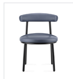
French Navy PU