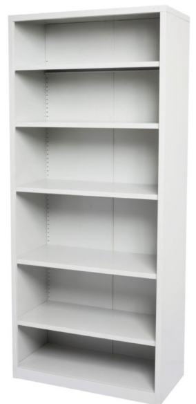
Clip Together Steel Shelving (GSC9422)