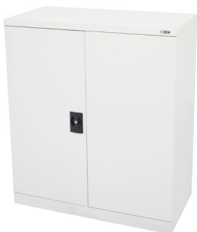
Go Swing Door Cupboard (GCA10)