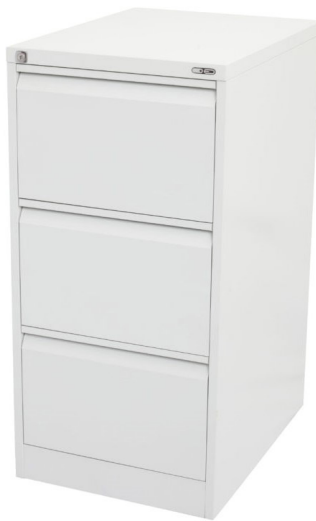
Go Vertical Filing Cabinet 3 Drawer (GFCA3)