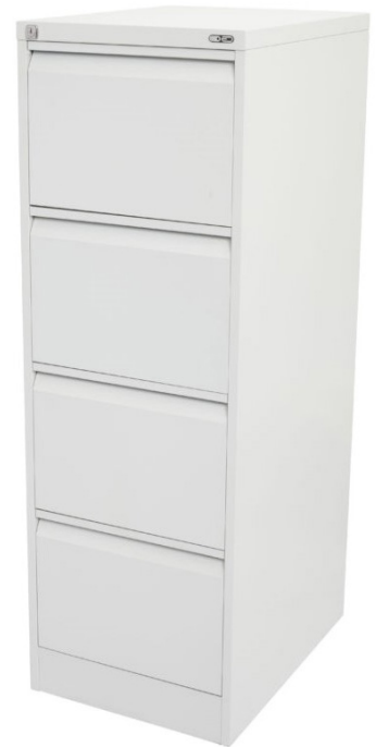
Go Vertical Filing Cabinet 4 Drawer (GFCA4)