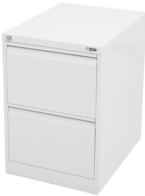
Go Vertical Filing Cabinet 2 Drawer (GFCA2)

Perfectly suited across a diverse range of interior workspaces within the commercial, aged care, health care, hospital and education sectors.